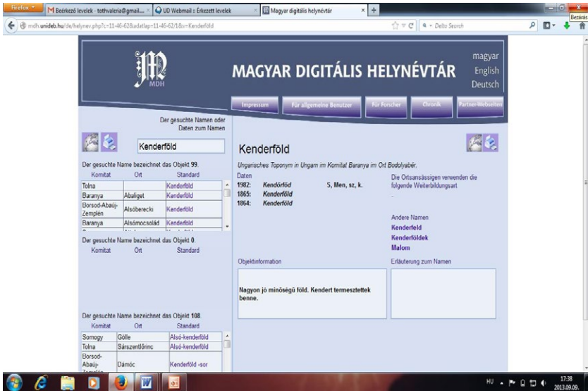
Fig. 2: Data page of the HDTR.

Searching for a lexeme or a structure (e.g. the name of a particular tree, a geographic common name or a postposition, etc.) will yield the same result.