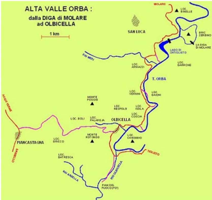
Map 2. The Upper Orba Valley, from the Molare dam to Olbicella

It should point out, also, that the nomina locorum derived from the root *alb- are part of a series of place names known on the basis of common names of various historical Indo-European languages, both in relation to