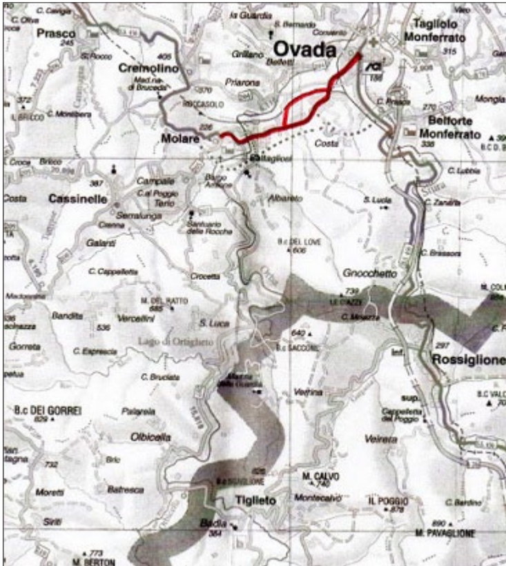
Map 1. Olbicella (coordinates 44°37'11"N 8°36'6"E) and the surrounding area

The derivation proposed by the Italian scholar, Olbicella < * Albicella < Albizo , is part of the traditional practice that enhances, for etymological purposes, the observation – widely seen in the micro-Toponymy – of the use of anthroponyms in order to coin local denominations, but in this case it is – because not accompanied by equally or even more sustainable alternatives – too much apodictic, as well as almost all the toponymic reconstructions that trace back the origin of a nomen loci (of higher “size” than one individual or gentilial property) to a proper name of a person of any origin, according to the possibilities offered by the historical and linguistic local stratigraphy, without even an attempt of comparison with names that, being verifiable – or falsifiable –